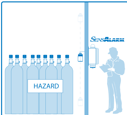
Gas Room Application - Sensor can be remote mounted at the ceiling, breathing or floor height depending on the gas hazard.

SENSALERT ® A member of the SensAlert family.